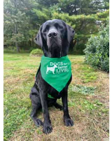
Certified Hearing Dog Poppy