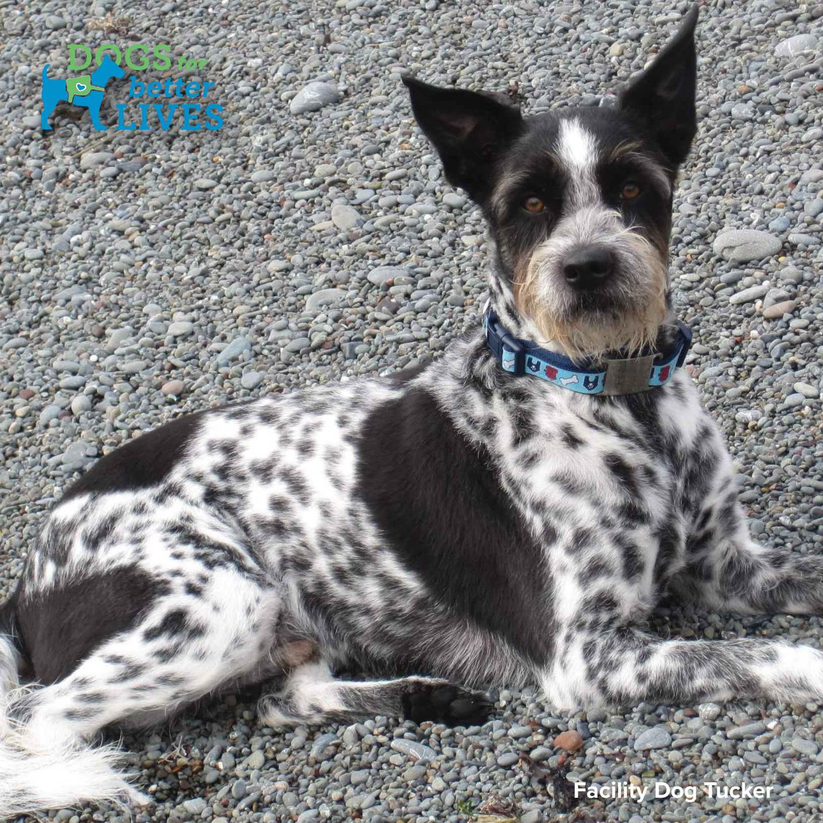
Facility Dog Tucker