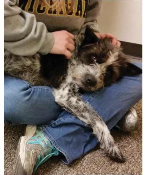
Facility Dog Tucker performs his 'lap' task with a client who is seated on the floor.

One notable moment was with a client who was extremely anxious. Without prompting, Tucker left his comfy dog bed, approached her, and curled up next to her. The client's visible relaxation was immediate, allowing her to finally share a burden she had carried for years.