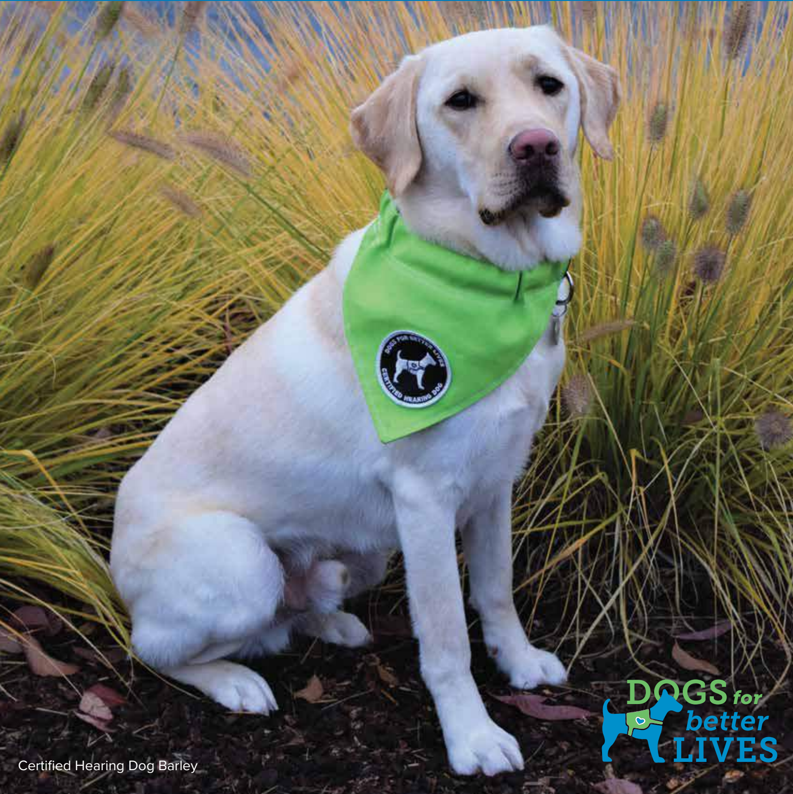
Certified Hearing Dog Barley