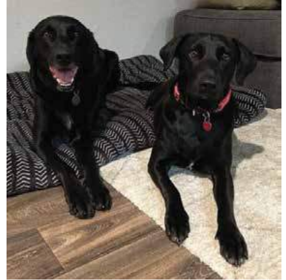
Annie and Walker before placement

To learn more about this unique program, visit dogsforbetterlives.org/shelter-to-service