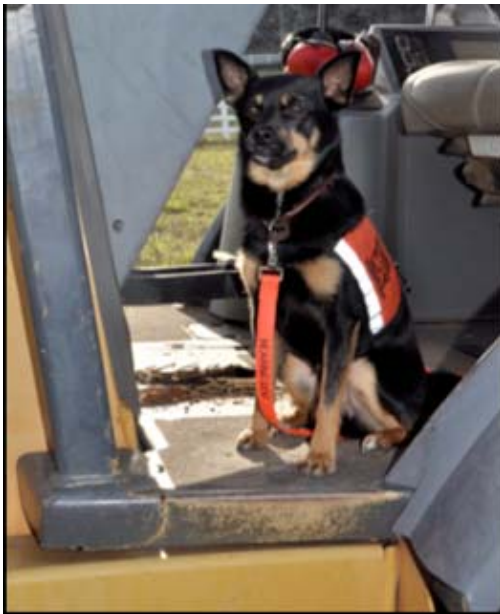
Demo dog Buzz, approves of the CASE 580 Super L tractor on the new construction site.